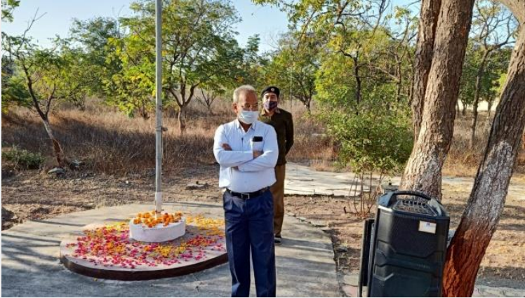
College staff and students celebrating Republic Day.