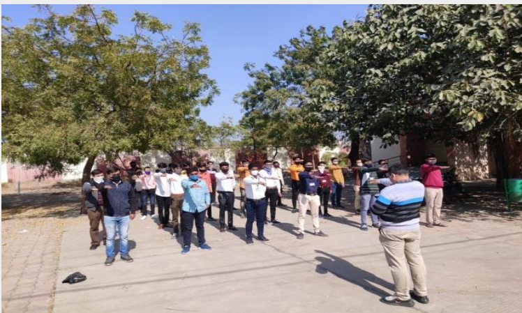
Systematic Voters Education and Electoral Participation (SVEEP) Oath taking Programme on 29th Jan 2021.